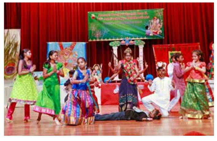
A performance by children during the finale segment