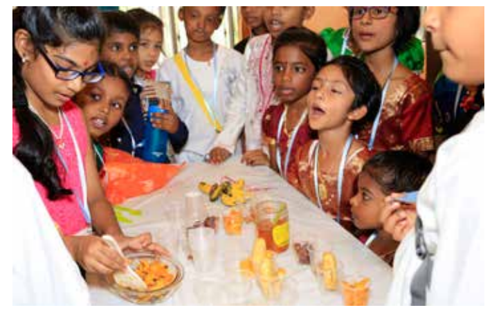
Children learning to make Panchamritam