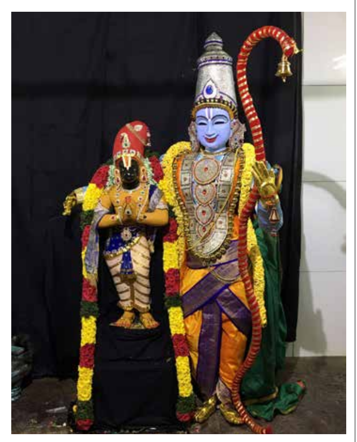
Sri Hanuman Jayanthi alankaram at Sri Srinivasa Perumal Temple on 29 December 2016