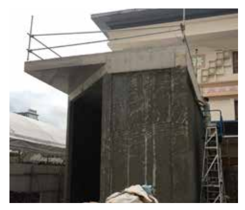
New home for the silver chariot under construction

Though Vastu started out with the construction rules for Hindu temples, it soon branched out to cover residential houses, office buildings, vehicles, sculpture, paintings and even what kind of furniture to buy for the home, office and Temple rooms, how to place the conference table in a meeting room and where the leader of an organisation should sit to conduct meetings.