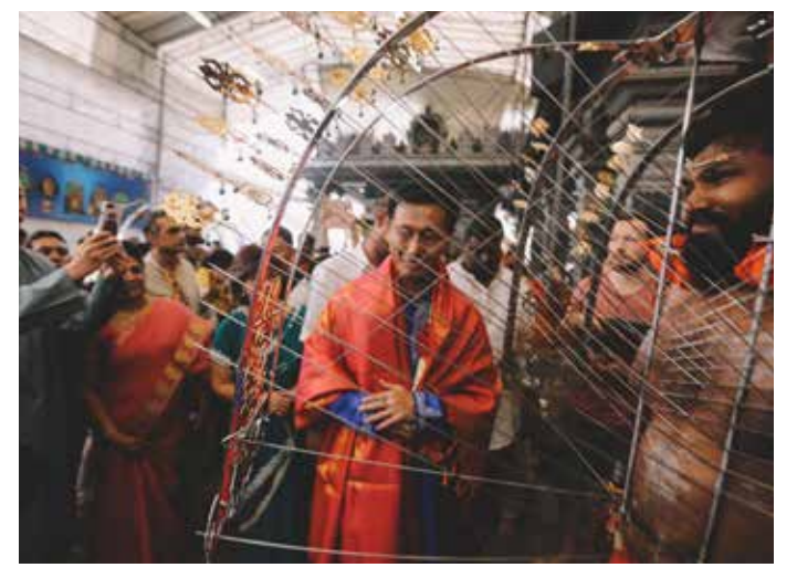
Guest of Honour, Education Minister (Higher Education and Skills) Ong Ye Kung (in red shawl), interacting with kavadi bearers in Sri Srinivasa Perumal Temple