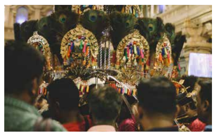
A kavadi bearer finally reaches his destination – Sri Thendayuthapani Temple