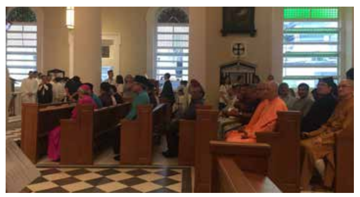
Members of the various interfaith groups at the Archdiocesan Interreligious Christmas celebration held on 29 December 2016 at Cathedral of the Good Shepherd