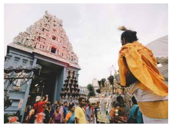
A priest sprinkling holy water on devotees and kavadi bearers as they embark on their journey of faith