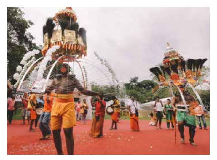
Kavadi bearers dancing at the "live" music point at Bras Basah Green