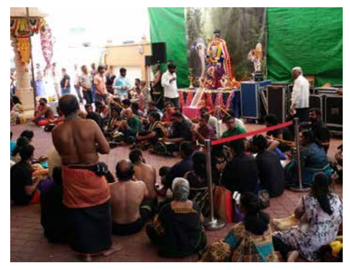
Devotees singing bhajans as part of Makara Vilakku celebrations at the Temple