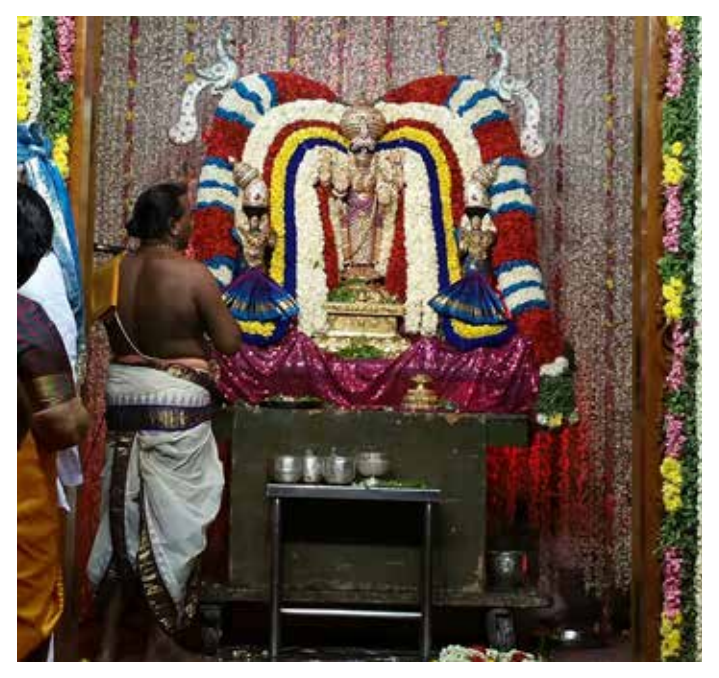
Vaikunda Ekadasi prayers (opening of the Swargavasal) were held at Sri Srinivasa Perumal Temple on 8 January 2017.