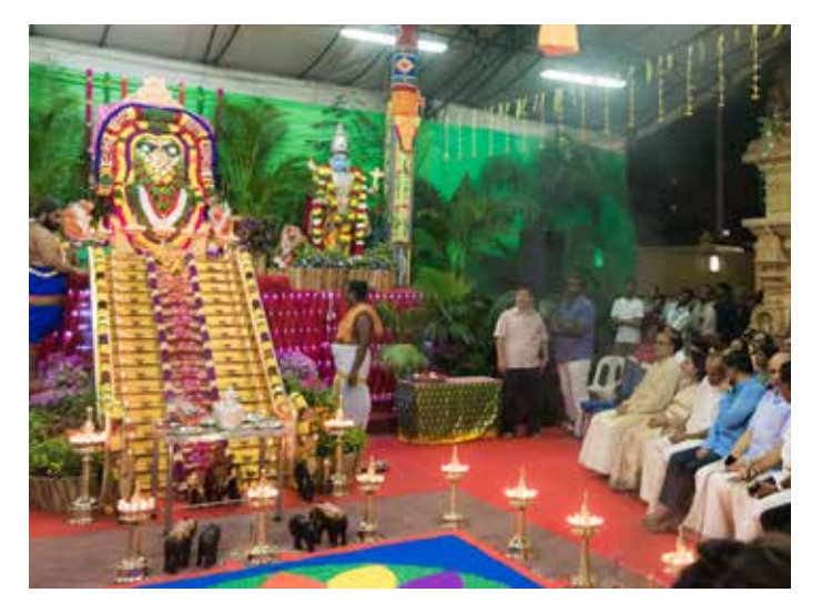
Prayers for Sri Ayyappan at Sri Vairavimada Kaliamman Temple on 14 January 2017