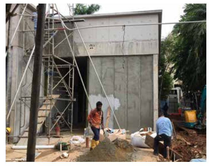
The new Temple kitchen under construction

"It was an eye-opener for me and my team on the kind of intricate details that the