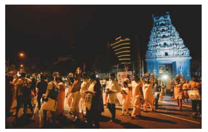
One of the first few batches of devotees carrying paalkudam leaving Sri Srinivasa Perumal Temple for Sri Thendayuthapani Temple