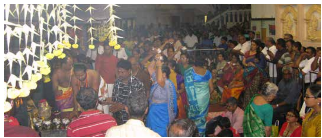
Devotees' paalkudam during the Sri Maha Kala Bhairavar Ashtami prayers held at Sri Sivan Temple on 21 November 2016