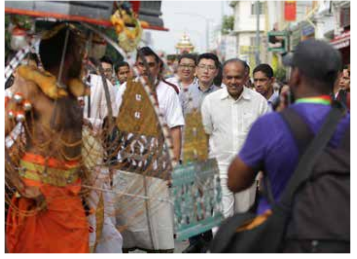
Mr K Shanmugam (Minister for Home Affairs and Minister for Law) meets kavadi bearers and thanneer pandhal volunteers during his walk along the procession route