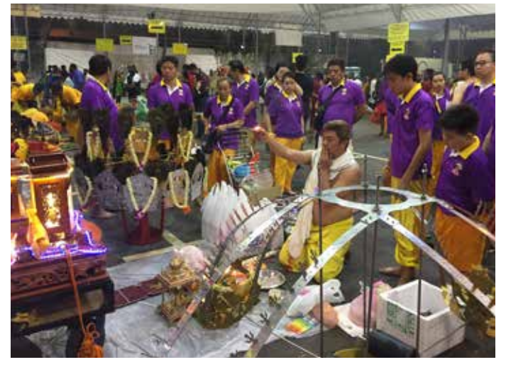
A Festival for one and all – a non-Hindu devotee offering prayers before mounting his kavadi