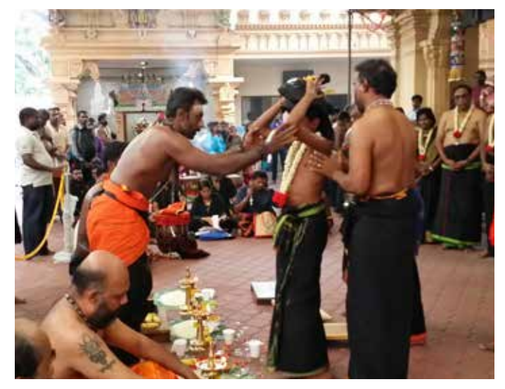
Devotees carrying the Irumudi as part of Makara Vilakku prayers