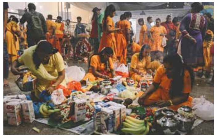
Devotees preparing their paalkudams in the early hours on Thaipusam day

haipusam is an annual Hindu festival celebrated in honour of Lord Murugan. Thaipusam was observed on 9 February this year. Around 50,000 participants and observers gathered for the Festival which stretched from Serangoon Road to Tank Road. Hindu News brings you the highlights of the Festival in pictures.