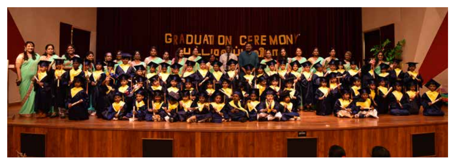
Graduating cohort of 2016

The theme for the graduation concert this year was 'What a Wonderful World'. The children brought home the message of making the world a better place, where people love and care for one another, and for countries to be peaceful and harmonious to live in.