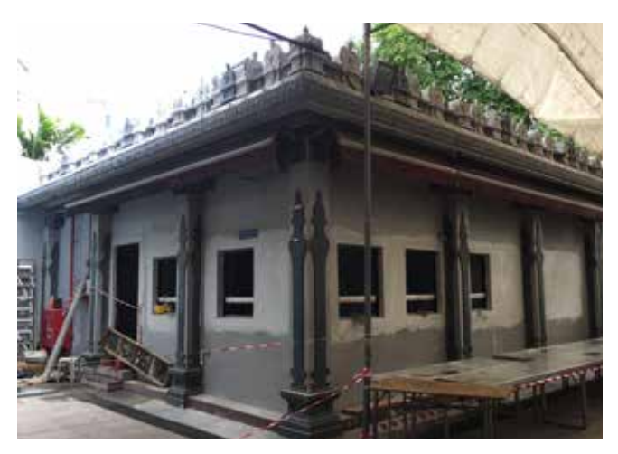
Works on-going for the Temple office to make it more user-friendly

When the works are in full swing, a Bhalasthaapanam ceremony to temporarily transfer the divine powers enshrined on the Kalasams (pinnacles) onto a picture depicting the kalasams has to be performed on an auspicious day and time soon.