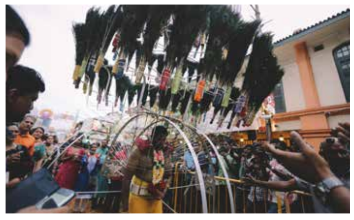
Crowds along the procession route cheering for a kavadi bearer