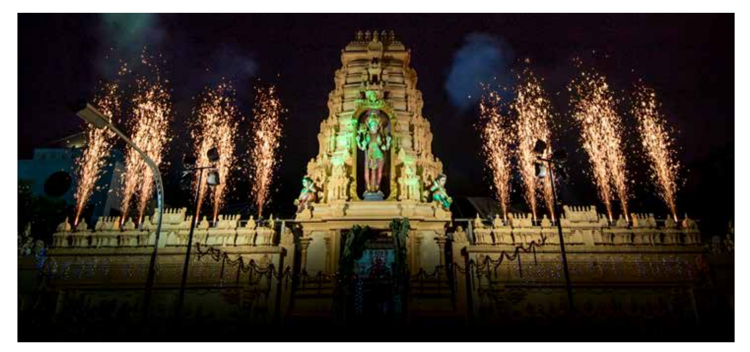
Special pyrotechnics to mark the 50th Anniversary of Makara Vilakku celebrations on 14 January 2017